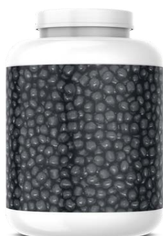
Pure-HD Black MFI 4-6