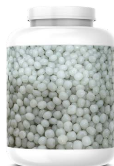
Pure-HD Natural MFI 6-8