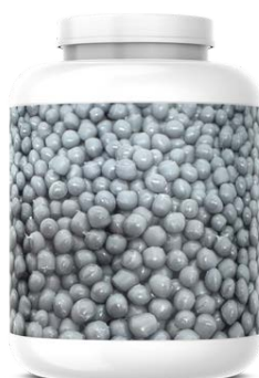
Pure-HD Dark Grey MFI 4-6